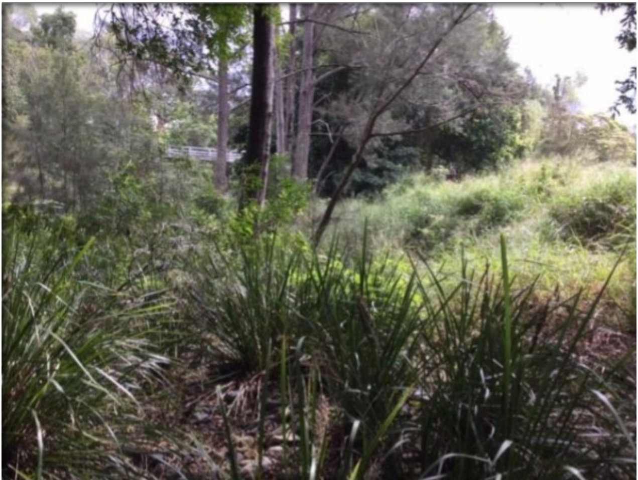
DOUGLAS FRANKLIN RESERVE (CLOSEBURN), 27/02/2019

The grant allowed for rainforest species to be planted in pockets where the canopy had been opened up. The 2019 summer season has been one of the driest on record however most plants that were planted well above the root ball have survived.