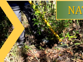
Above: Trish and Popper in action!