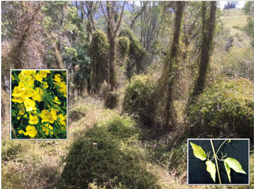
Photos, information and hard work courtesy of Janet Mangan, September 2017.

*Native to tropical America, cat's claw creeper is an aggressive climber that was once used as an ornamental plant in Queensland gardens. In the wild, cat's claw creeper can smother native vegetation and change soil chemistry ... Cat's claw creeper is a restricted invasive plant under the Biosecurity Act 2014 — see https://www.business.qld.gov.au/industries/farms-fishing-forestry/agriculture/land-management/health-pests-weeds-diseases/weeds-diseases/invasive-plants/restricted/cats-claw-creeper * Source: Flower and leaf/claw photos (above) © Qld Government.