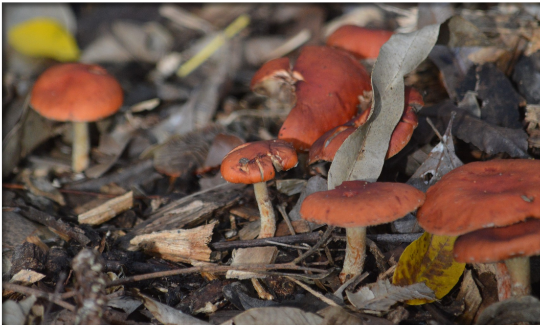
Photo (above) taken at Kumbartcho Sanctuary, 12 July 2017, by Lainie Peltohaka.

RSVP: Friday 9 November 2017 for catering purposes—please send your name, number of attendees and contact number to esmailbox@moretonbay.qld.gov.au or call 3205 0555 to book, referencing the ‘Voluntary Conservation Programs - Fungi Workshop’.